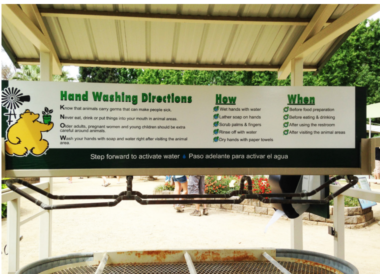
Hand Washing Station, California State Fair