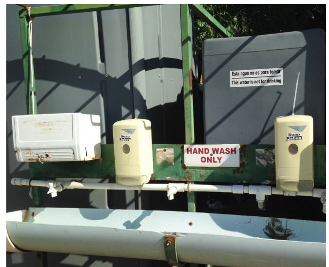
Hand Washing Station, Riverdance Farms