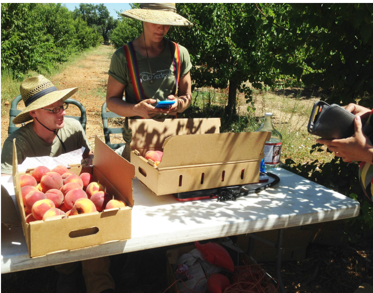
Weighing station, Cloverleaf Farm, Dixon, CA