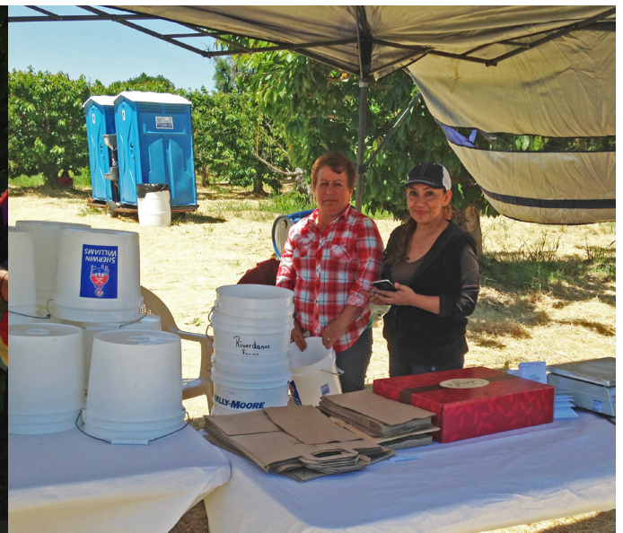
Weighing station, Riverdance Farm, Livingston, CA