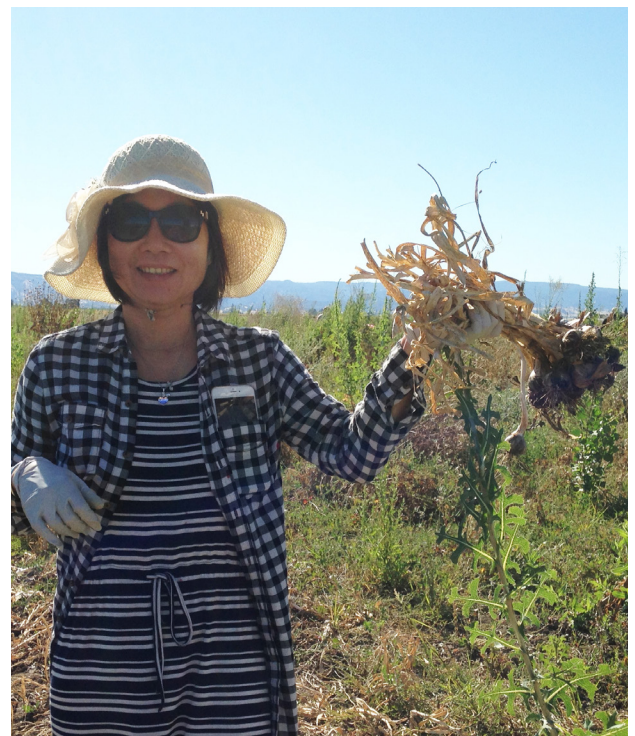
Harvesting Garlic, Eatwell Farm, Dixon, CA

U -Pick farming is generally allowed “by right” or with a relatively low-fee “site-review” or “administrative” permit on land zoned agricultural in most California counties. However, other county regulations may apply to your U-Pick operation. You will generally be expected to provide parking on-site for your customers (not on county roads), and to provide adequate accommodations for people with disabilities, as determined by your county’s interpretation of Americans with Disabilities Act requirements. There may also be regulations that limit events, limit