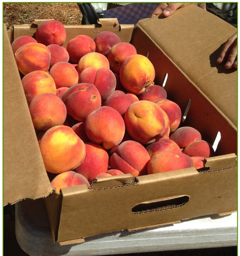
Fresh-picked peaches, Cloverleaf Farm, Dixon, CA

An effective layout will create a clear, straightforward experience for customers and farmers. Many perennial U-Pick crops take a long time to establish, so carefully plan their placement to avoid having to move them later. Annual crops are more flexible; the spring strawberry patch could be next year's pumpkin patch, for example.