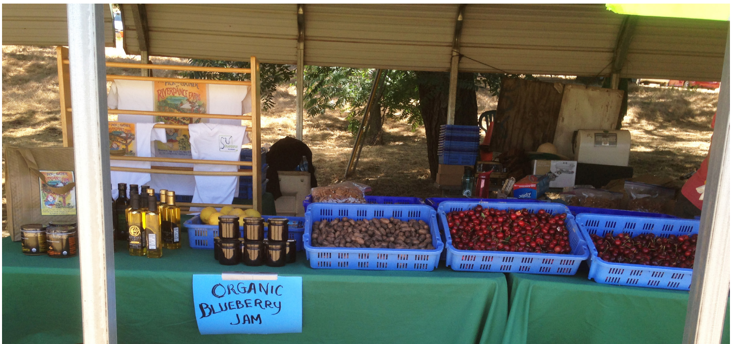
General store, Riverdance Farms, Livingston, CA

Adding complementary products and services may involve additional regulations. For example, producers with concession stands selling products besides fresh raw produce grown on site will need to contact their county Environmental Health Department to learn and comply with food handling regulations and to obtain any needed permits or licenses. Farmers making value-added food products such as jams and jellies or baked goods will need to produce these items in kitchens registered and permitted by their county Environmental Health Department.