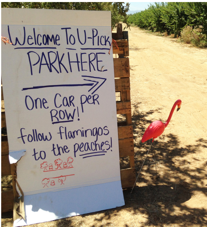
Parking Instructions, Cloverleaf Farm, Dixon, CA

Use signs, ropes, fence, and flags to prevent customers from wandering into an area that has recently been sprayed, contains farm equipment or chemicals, or is otherwise unsuitable for visitors.