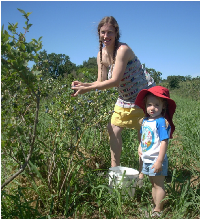
Blueberry pickers at Riverdance Farms, Livingston, CA

A U-Pick operation is a direct marketing channel where customers visit the farm to harvest fruits, vegetables, flowers, or trees on their own. Like any marketing channel, a U-Pick has advantages and disadvantages. On one hand, it offers customers fun, memorable experiences that often become seasonal outdoor family traditions. For farmers who spend the majority of their time on their property, bringing in customers can be a nice way to meet neighbors and community and can be an additional sales channel that eases marketing risk. On the other hand, bringing visitors to your fields and orchards opens you up to many risks. This guide examines the U-Pick model, helps you determine whether it's suitable for your farm and gives examples and suggestions for planning and building your U-Pick operation.