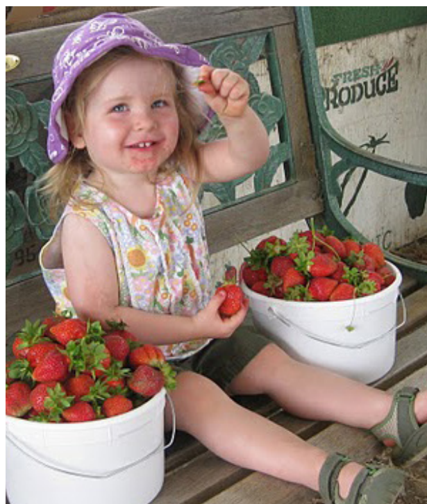
Young strawberry picker, Pacific Star Gardens