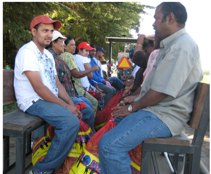
Pickers returning from fields, R. Kelley Farm, Sacramento, CA

All communications suggest that customers phone before they come to make sure what crops are available.